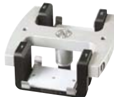
Swing-out rotor, 2-place illustrated with carriers 3730-R