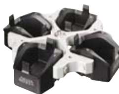
Swing-out rotor, 4-place illustrated with carriers 5632-R