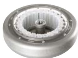
Swing-out rotor, 24-place, for microlitre tubes

The MIKRO 220 Robotic can run with a swing-out rotor for microlitre tubes and a swing-out rotor for HPLC tubes. Centrifugation of flammable materials is not allowed; application is therefore restricted to non-flammable solvents.