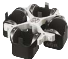
Swing-out rotor, 4-place illustrated with carriers 3725-R

The standard accessories for the ROTINA 380 Robotic models include two swing-out rotors with suitable carriers.