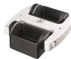
Swing-out rotor, 2-place illustrated with carriers 5631-R