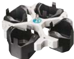
Swing-out rotor, 4-place illustrated with carriers 4486-R

A comprehensive range of standard accessories is available for ROTANTA 460 Robotic centrifuges. Three swing-out rotors and eleven sorts of carriers are available for centrifuging different tubes and plates.