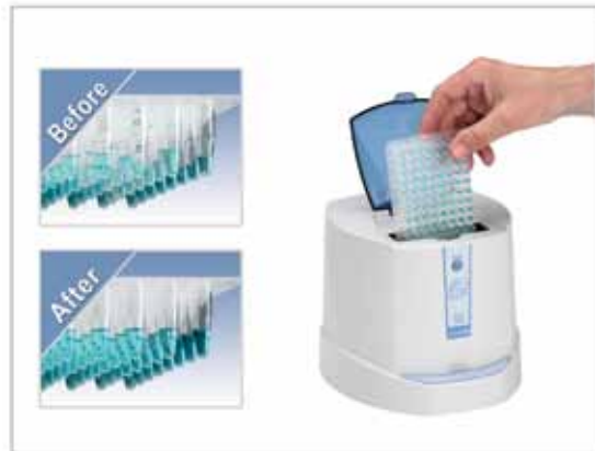
Loading a plate