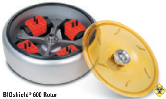
BIOshield® 600 Rotor