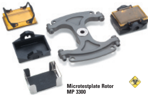
Microtestplate Rotor MP 3300