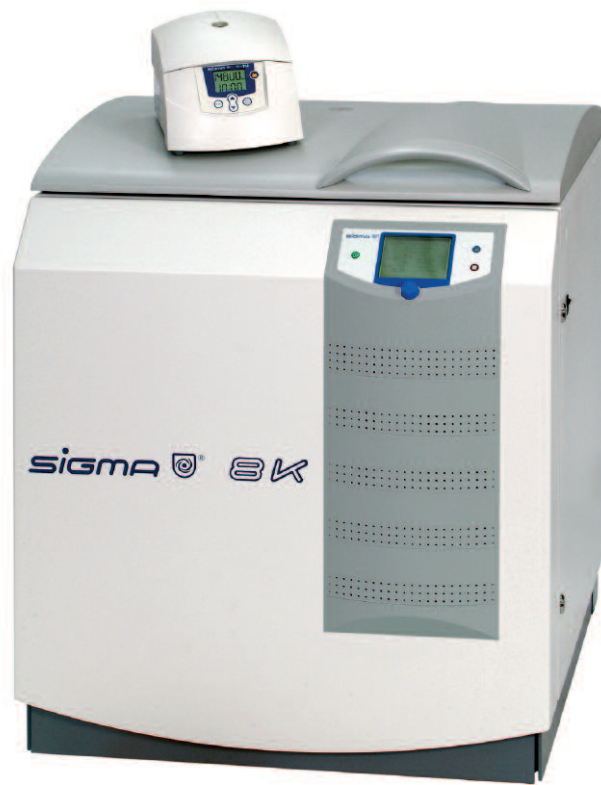
Delivery without microcentrifuge